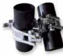
Forged Swivel Coupler