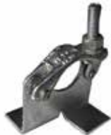
Board Retaining Clamp