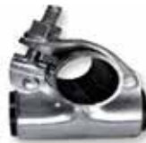
Forged Putlog Coupler