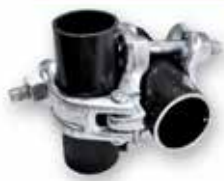
Forged Double Coupler

Scaffold couplers are essentially the fundamental component that is used to assemble tube-and-coupler scaffolding. This basic fitting is designed to join two scaffold tubes that can be used to create a diverse range of scaffolding structures.