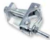
Gravlock Girder Clamp